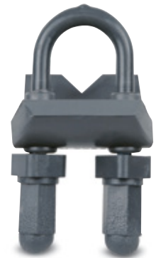
Right Angle (RA)